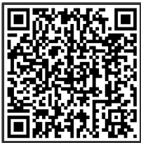
Listen to the Dialogue